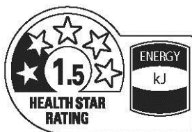
Diagram 2 Trademark example of a single energy icon with the star rating